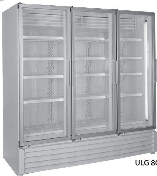
ULG 80 BC