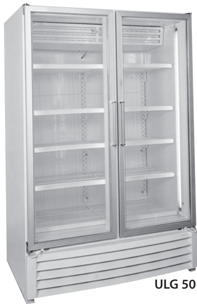
ULG 50 BC