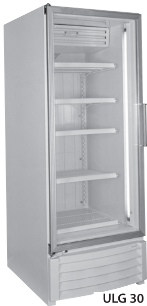
ULG 30 BS